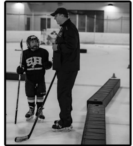
Working hard, having fun and getting better.