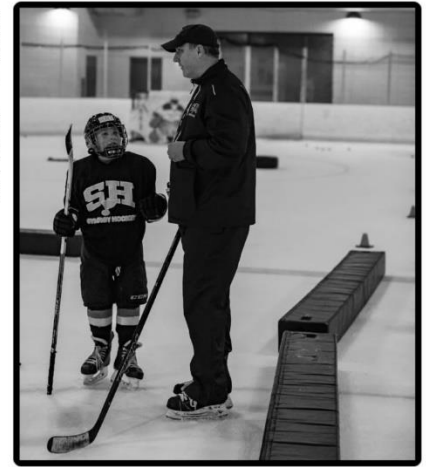
Working hard, having fun and getting better.