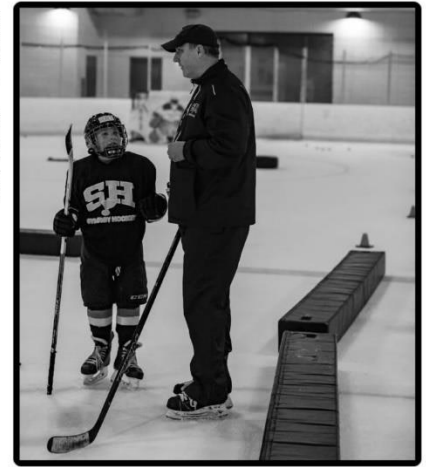
Working hard, having fun and getting better.